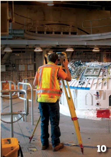
Penfield & Smith, a Santa Barbara, CA firm, applies surveying technology to rockets.