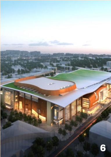
Aerial rendering of Nashville Music City Center, view from 5th & Demonbreun