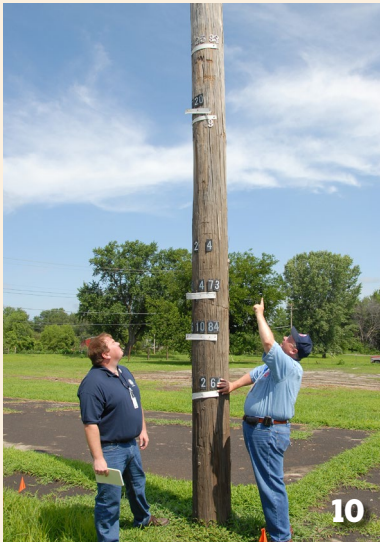
6-23-07—Buchanam Co MO EMA Director points to a high water flood mark on a flood pole.