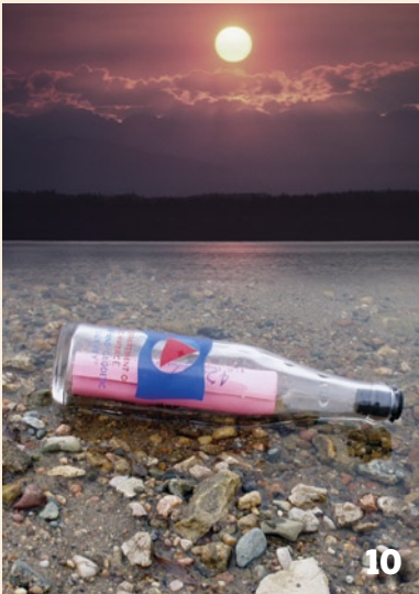
Artist's conception of one of thousands of drift bottles released by the Coast & Geodetic Survey to determine ocean currents.