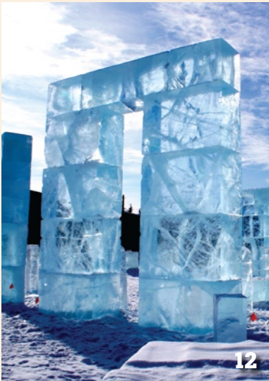
Surveyors erect a “cool” replica of Stonehenge.