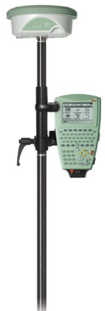
The Leica SmartRover