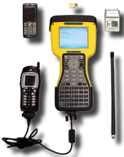
Figure 2 Rover components often accommodate multiple communications options. This data collector offers (clockwise from upper right): a slot for the compact-style cell card, connections for a rover radio and antenna, serial and USB ports for connection to cell via cable, connection to cellular via Bluetooth. The unit itself (center) has built-in WiFi capability. Also pictured (at top) is the SIM card that fits into cellular devices containing the user account information.

Dumb modem, FAX-modem – whatever folks call it – all it really needs to do is connect to the cellular network, and connect to your rover. This could be a “data capable” digital cell “phone”, a dedicated “cellular modem”, or another device that has a cellular “card” built into it. The GNSS equipment manufacturers are accommodating this trend with built-in or easily connected mobile data capability