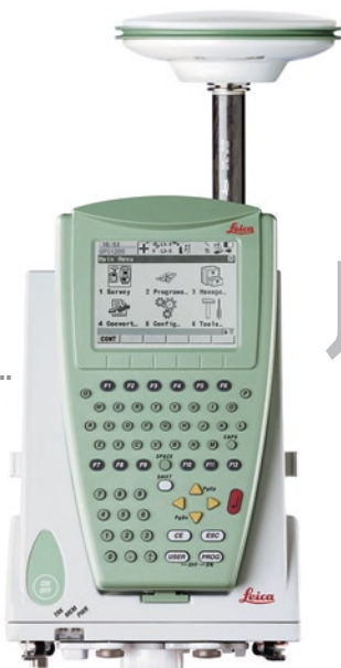
The Leica GPS1200