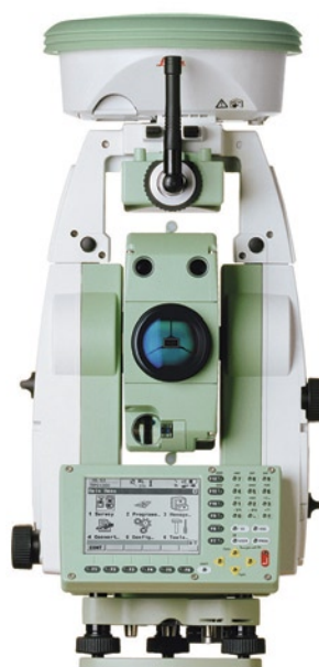
The Leica SmartStation