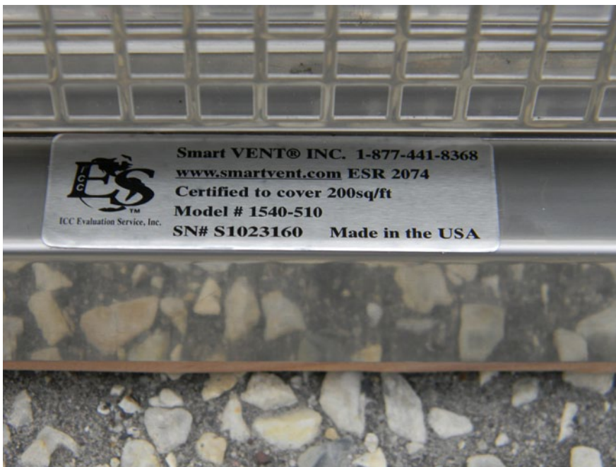
A label on every Smart Vent identifies the ICC-ES report number (ESR), the model number, and the area of certified coverage.