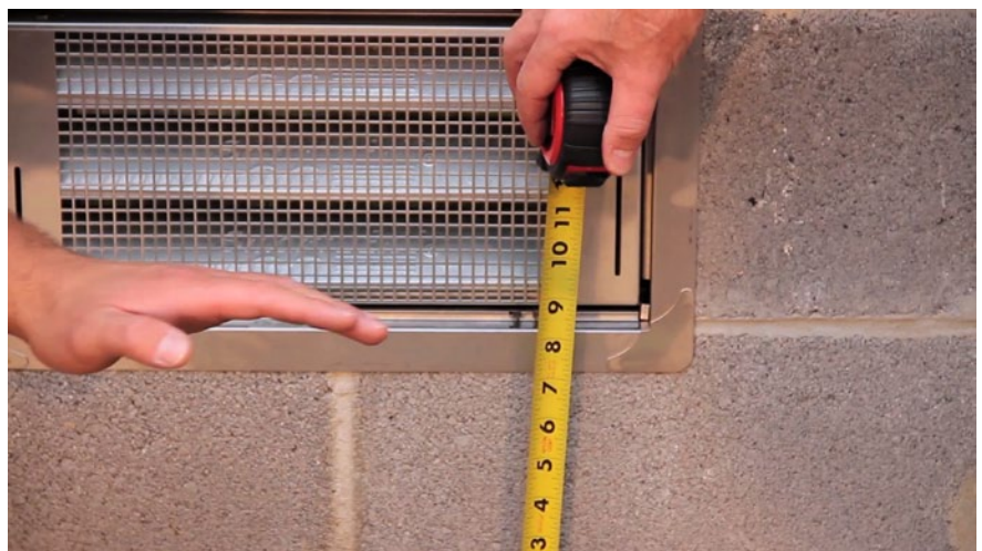
Remember that the bottom of the flood opening (where water will enter, not the bottom of the frame) must be within 12 inches of adjacent grade to comply with regulatory and insurance requirements.

Engineered flood openings can be confusing to surveyors who must identify and report them in Section A of the Elevation Certificate. Compounding the problem is the common presence of vents meant for air circulation, but these do not serve as proper flood openings unless