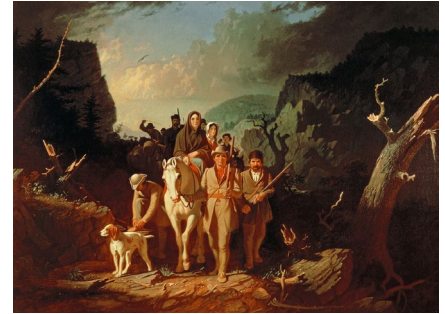
Daniel Boone Escorting Settlers Through the Cumberland Gap by George Caleb Bingham

Success in surveying necessitates close observation, intelligent investigation, judicious weighing of evidence, self-reliance, prompt decision and action. The Surveyor in the field has no opportunity to consult authorities, to counsel with others, or hold under advisement for subsequent adjudication. He must think and act for himself, and that quickly and