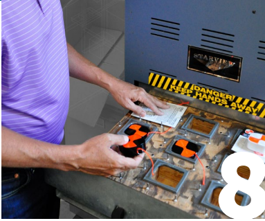
A long-time industry veteran's company provides high-quality accessories.